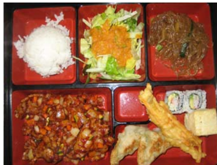
Je Yuk Box