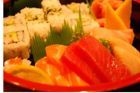
Lunch Sashimi Combo

Lunch Sushi Combo 6 pcs of chef's choice nigiri sushi & 6 pcs of California Roll. No substitutions. 11.95