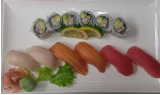
Lunch Sushi Combo