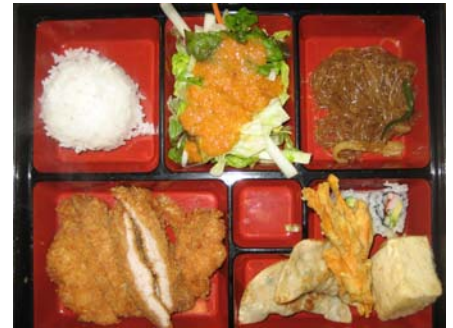
Chicken Katsu Box

Kitchen Lunch Specials | Served with kimchi