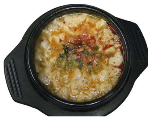
Soon Du Bu